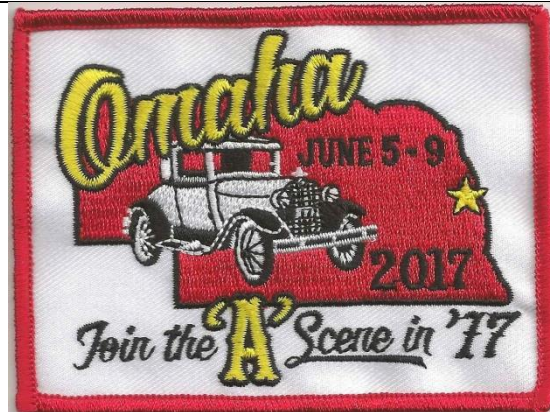
3"x4" Embroidered Patch (One included per registration)