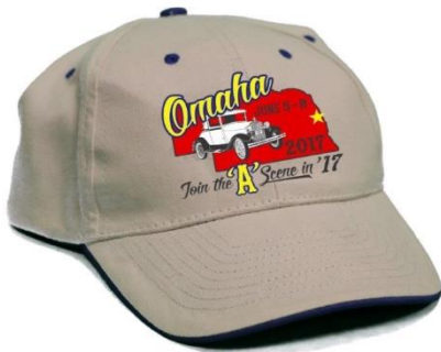
Ball Cap ($15)