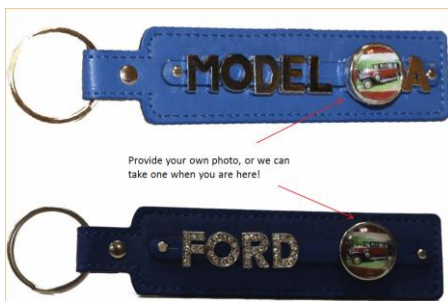
Custom Key Chains ($20)

Available to purchase and order onsite! Customized with a photo of your car.