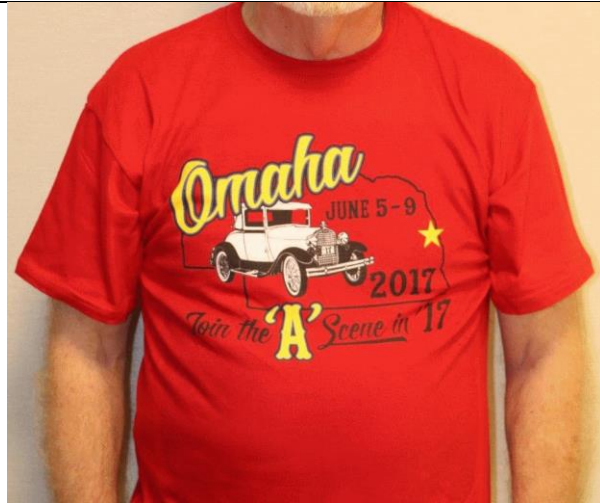
T- Shirt ($15)

Indicate your selections at the bottom of Page 1 on the Registration Form