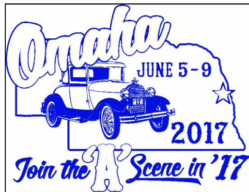
2"x3" Cling Decal